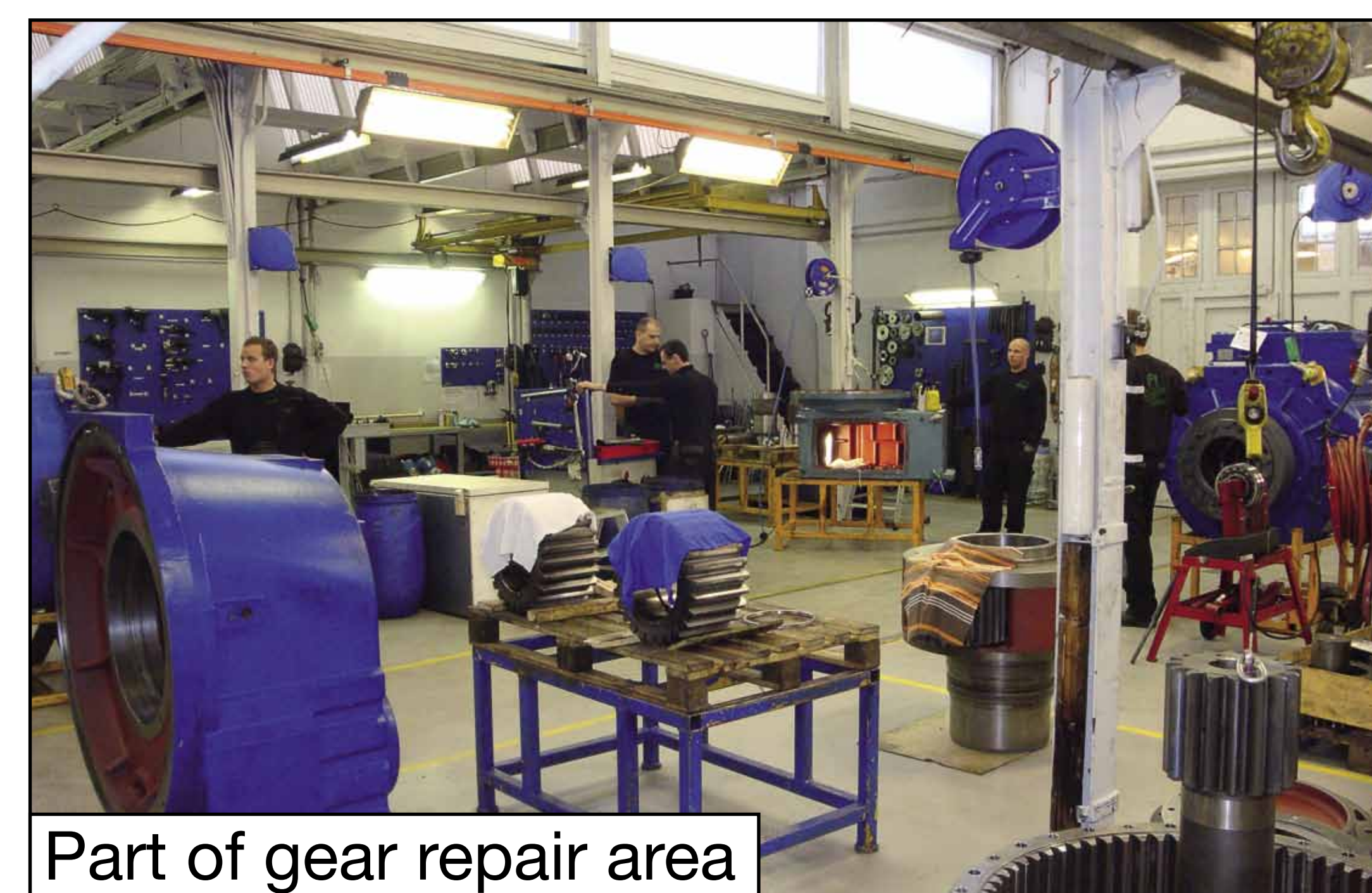
Part of gear repair area