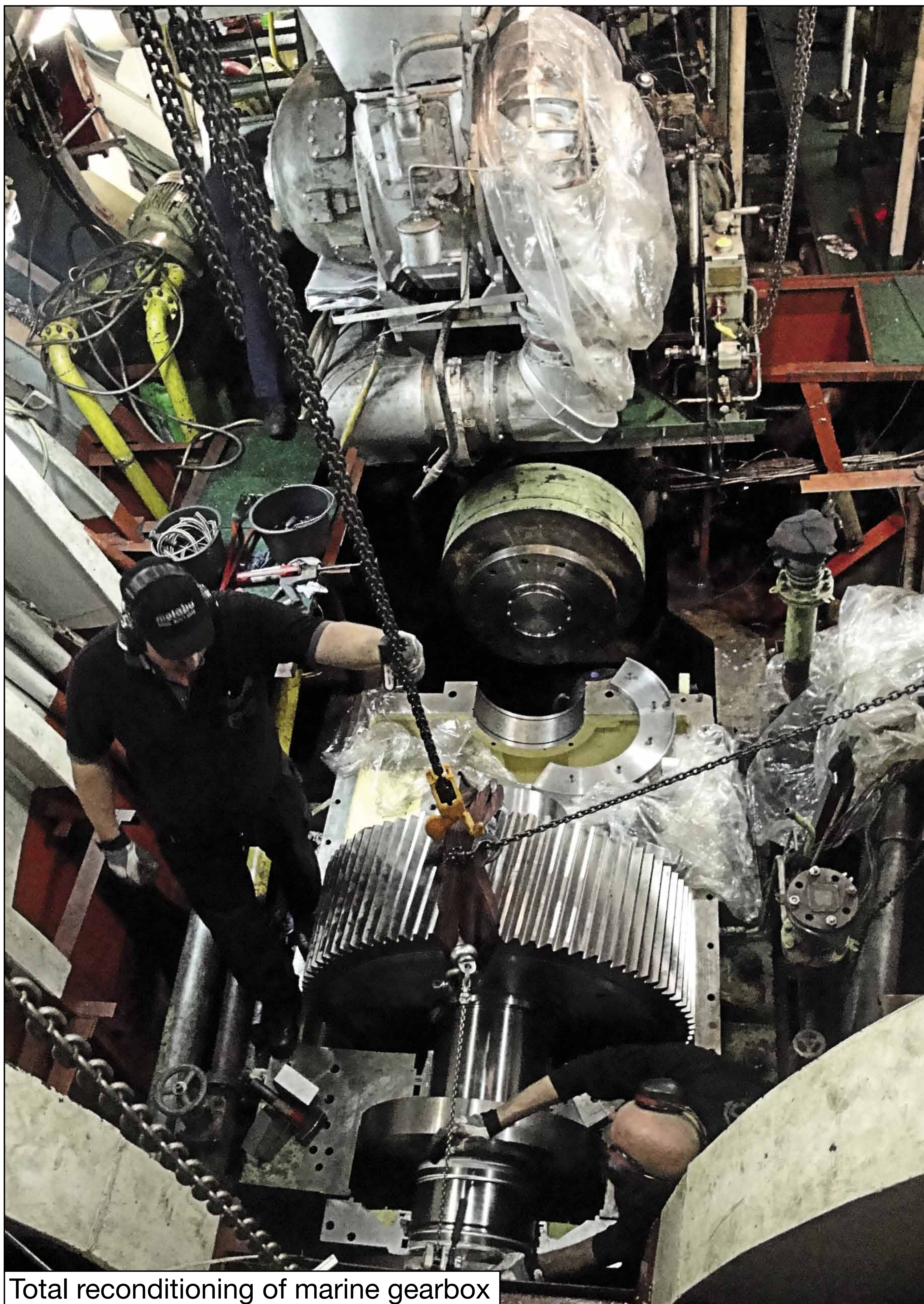
Total reconditioning of marine gearbox